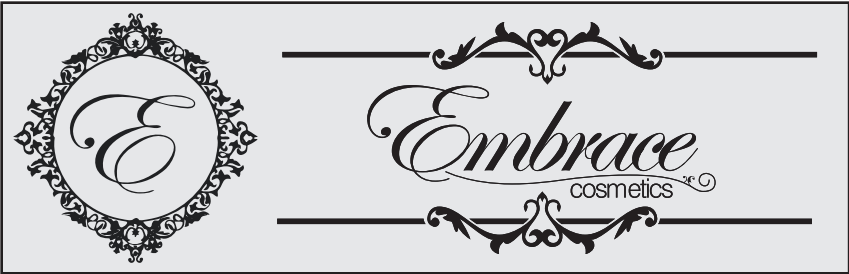
Plate #3 Gold printing