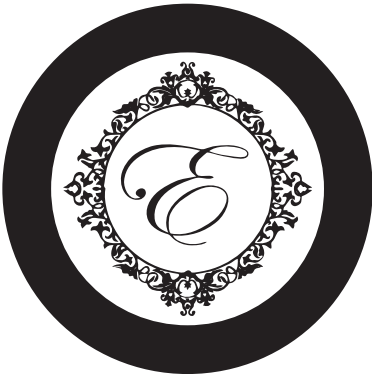
Plate #2 Black printing